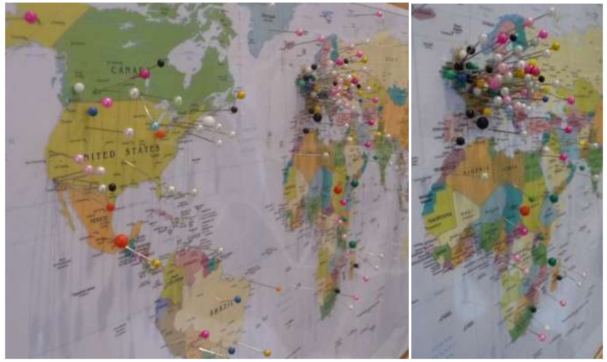
The World: point-of-origin map

Knowledge is knowing a map is a guide; Wisdom is not taking its content too literally.