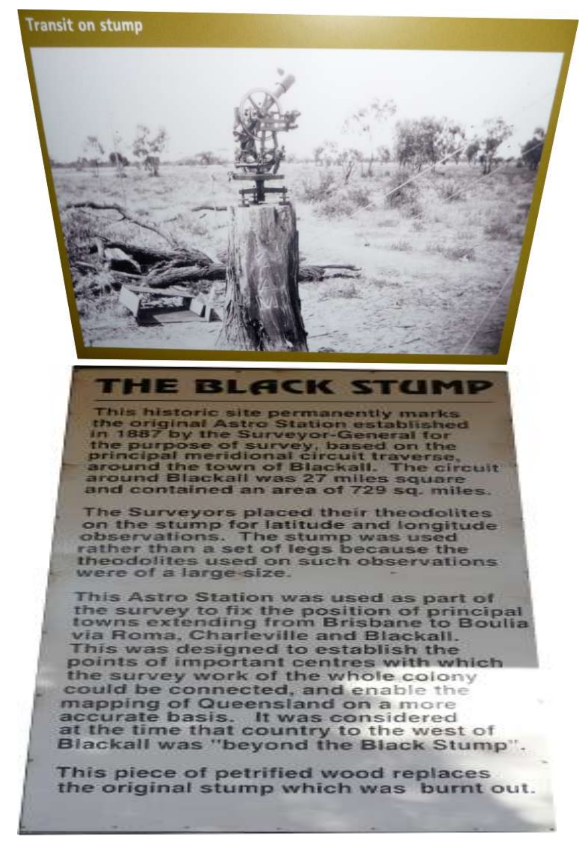
[Editors note: Sorry about the quality of these digital camera images.]